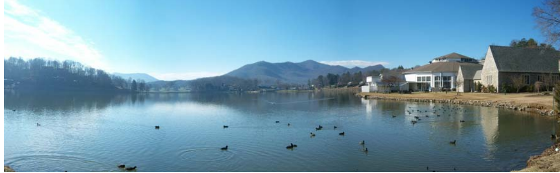
Lake Junaluska, Winter 2009