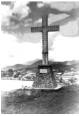
The original Junaluska Cross.

A beacon of light and hope, the Junaluska Cross was constructed by The Federation of Wesley Bible Classes of the Western North Carolina Conference in 1922. A five-foot stone base supports this twenty-five-foot high Cross, which contains approximately 200 bulbs that illuminate it. Directly below the Cross lies the amphitheater. In 1988, the Junaluska Associates built the Junaluska Amphitheater, which hosts vesper meetings and other religious services in addition to the Easter Sunrise service.