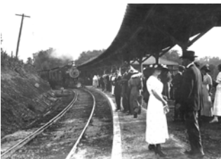
Passengers patiently wait at the old Junaluska depot.

Furthermore, in 1915, the Southern Railroad built a depot in response to the traffic as a result of the Assembly. Because Lake Junaluska was a summer residence, a small community began to grow around the lake. In the summer, mothers and children moved to the lake; in the meantime, husbands often visited their families on the weekends. When the fall came, some