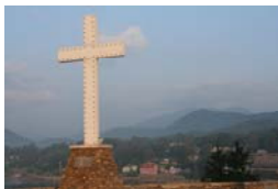
The Cross today.

The only other times during Lake Junaluska’s history when the Junaluska Cross has