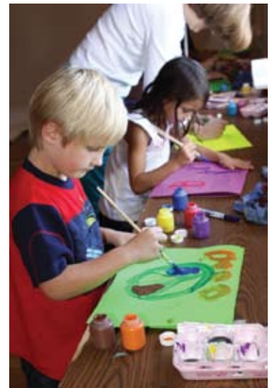
Children create peace signs for the 2010 Lake Junaluska Peace Walk.