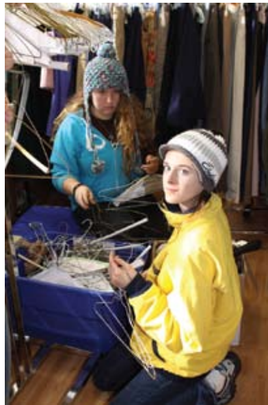
Instead of skiing during MYP INFUSE winter retreats, Simpsonville UMC volunteered at Haywood Street Congregation in Asheville, NC.

Visit www.myp.lakejunaluska.com for more information about SURGE into Missions.