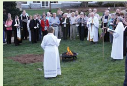
Easter at Lake Junaluska unites the community as we share the story of the Resurrection.

Lake Junaluska Conference and Retreat Center invites you to a weekend of events celebrating the life, death, and resurrection of Jesus Christ, April 22–24, 2011. Beginning with an evening service on Good Friday and ending with an outdoor sunrise service overlooking Lake Junaluska on Easter morning, participants are certain to experience these Holy Days in a meaningful way. All of the events are open to the public and to anyone who wishes to attend specific events. A special lodging package is available for those who want to stay for the weekend and take time to relax and reflect in the picturesque surroundings of the lake and mountains.