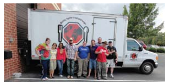
WCU Wesley Foundation students fight hunger by packaging food at a “Stop Hunger Now” event.

The Wesley Foundation at Western Carolina University invites you to shake off the winter chill during their inaugural Golf Classic on April 16, 2011, at the Lake Junaluska golf course.