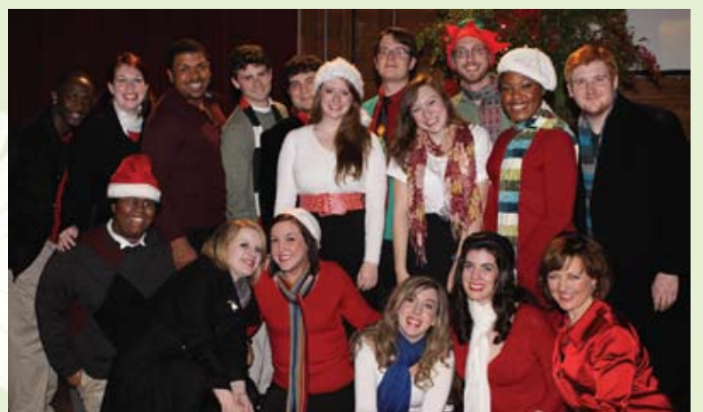
The 2010 Lake Junaluska Singers celebrate the end to a successful season at the Appalachian Christmas concerts.