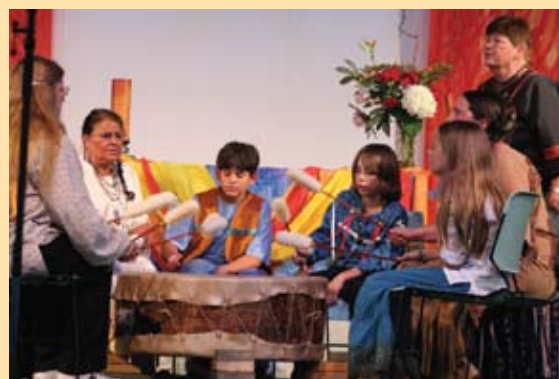
The 2011 Native American Summer Conference will feature unique worship and spiritual growth opportunities for all ages.