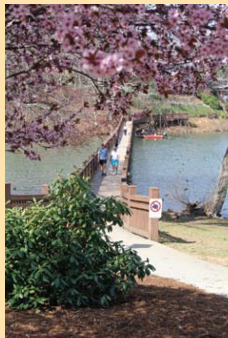
Lake Junaluska visitors and residents enjoy the changing seasons at Lake Junaluska while walking around the 2.6-mile walking path, which includes the Turbeville Footbridge.

Christian hospitality where lives are transformed through renewal of soul, mind, and body.