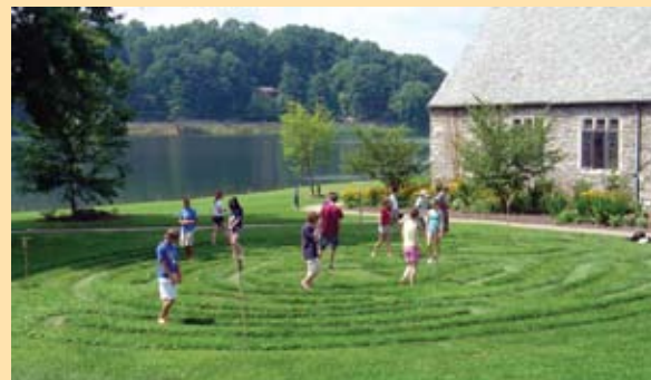
The Lake Junaluska labyrinth at Memorial Chapel is a serene area for people to reflect and meditate.