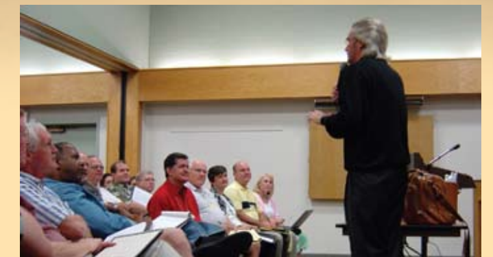
Leonard Sweet's leadership seminar in August is just one of the many opportunities persons will have to learn from Sweet. Sweet will be presenting and preaching at Lake Junaluska the entire week of August 8-14.