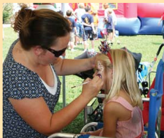
Families will enjoy a beautiful July 4th at Lake Junaluska. Face painting, a parade, a barbecue lunch, Lake Junaluska Singers concerts, and fireworks make for a complete celebration of Independence Day.