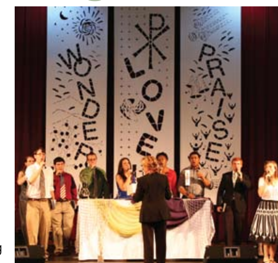
The Lake Junaluska Singers perform seasonally at Lake Junaluska and tour churches during the summer.

For more information and to register for the 2011 Lake Junaluska Ministry Summit, July 31 - August 2, visit www.lakejunaluska.com/summit or call 828-454-6656.