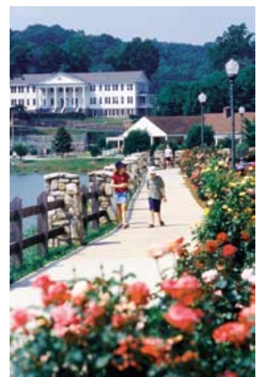
Countless improvements around Lake Junaluska have been made thanks to generous donations.

Members of the three societies are recognized annually through the annual report, at the donor recognition banquet, and are presented with clay medallions unique to their society containing silt from the lake.