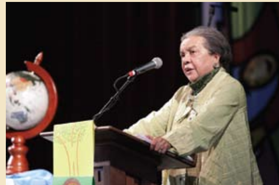
Dr. Marian Wright Edelman encourages persons of faith to speak out for children at the 2010 Lake Junaluska Peace Conference: Peace for the World's Children.