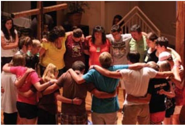
Youth groups from across the Southeast grow in Christ at Lake Junaluska MYP events.