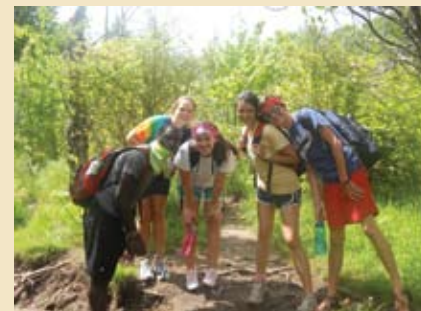
Ministries with Young People summer staff enjoy their free time by hiking in the nearby Blue Ridge Mountains.