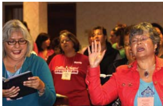
All pastors and lay persons are welcome to attend the 10th annual Native American Leadership Retreat, which will be held at Lake Junaluska, February 24-26, 2011.

SEJANAM is the advocate for 23 Native American congregations and four other ministries on