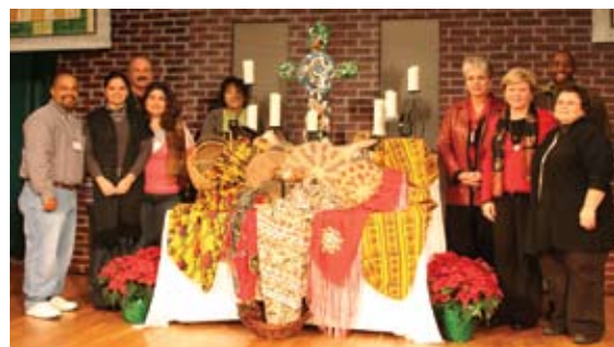
Participants from the Florida Annual Conference at the 2007 Multicultural Conference.

Registration is still open for this event, and 1 CEU credit is available. To register or for more information, call 828-454-6656 or visit www.lakejunaluska.com/multicultural .