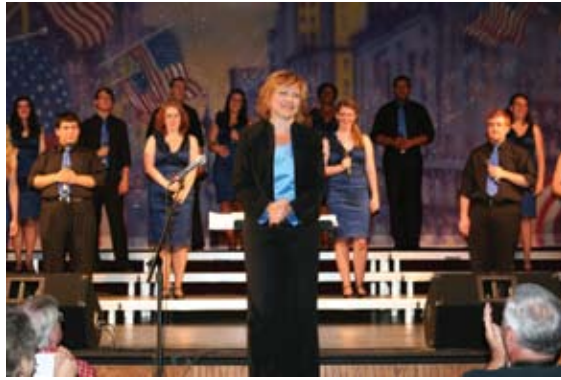
The Lake Junaluska Singers perform regularly at worship services, including Sunday worship at Lake Junaluska.

are "bringing hope to the world through inspiring music."