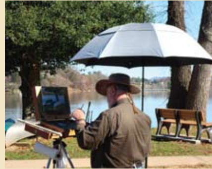
Artists from across Western North Carolina gather to capture the beauty of Lake Junaluska at the 2009 Plein Air Artist Event.