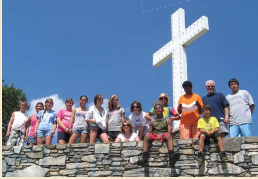
Youth from Davis Street UMC in Burlington, North Carolina, pose at the Lake Junaluska cross during their SURGE mission experience.