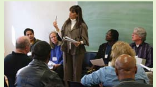
Gifts to Lake Junaluska impact many people by supporting ministry programs and facility improvements.

Gifts in memory or tribute can be made through any of the above means.