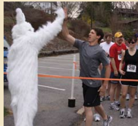
The Easter Bunny encourages 5K and 10K runners at the annual Lake Junaluska Bunny Run.