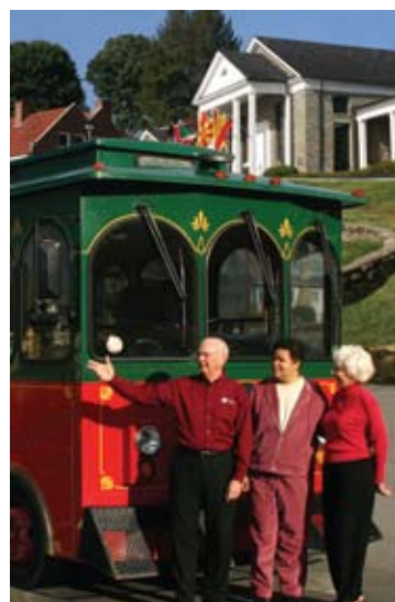
Gifts from the Junaluska Associates made the purchase of the Lake Junaluska trolley possible.

The Francis Asbury Society recognizes donors that pledge to support Lake Junaluska with total gifts of $5,000 to $49,999 over a five-year period. The ministries of Francis Asbury and Lake Junaluska came together at a crossroads on Richland Creek. One of the founders of American Methodism, Francis Asbury traveled along Richland Creek, where Lake Junaluska is now located. Asbury could hardly