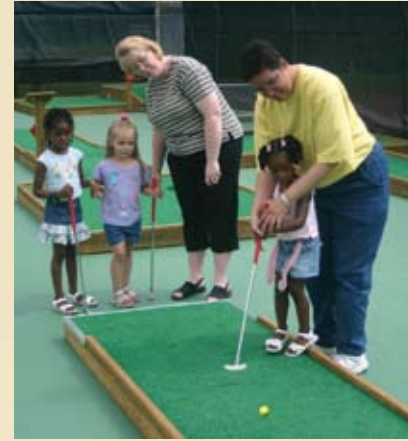
Each summer, families enjoy miniature golf at the lake.