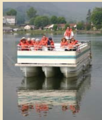
Groups enjoy a relaxing guided trip around Lake Junaluska.

For a full list of events, visit www.lakejunaluska.com/calendar.aspx