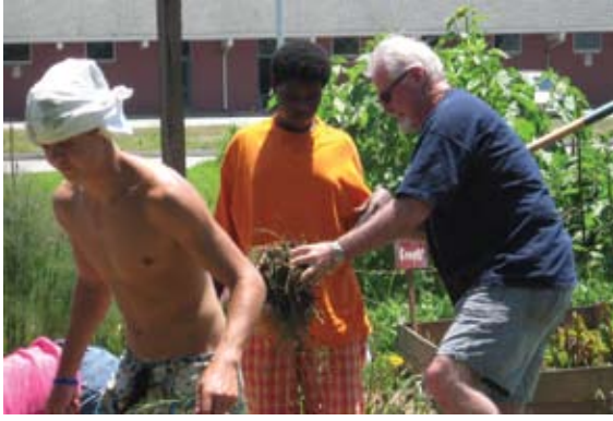
Davis Street UMC youth volunteered in a community garden during SURGE 2010.

Micah 6:8 - "What does the Lord require of you, but to do justice, to love mercy, and to walk humbly with God."